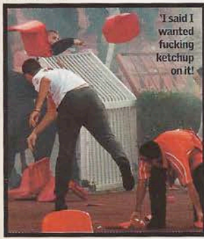
'I said I wanted fucking ketchup on it!'

getting busy with knives, iron bars and flares. Visit www.fc-redstar.net or www.partizan.net for fixture and ticket information. Fly BA to Belgrade, from £179.