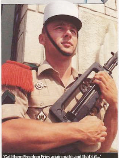
'Call them Freedom Fries again mate, and that's it...'